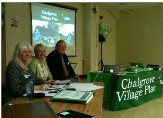
Chalgrove celebrate their plan

Chalgrove had 600 new volunteers come forward to help with the actions identified in their village plan.